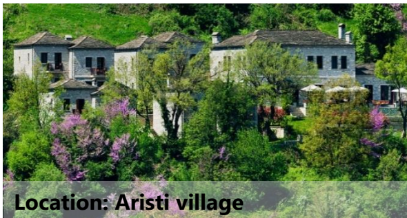
Location: Aristi village