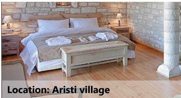
Location: Aristi village