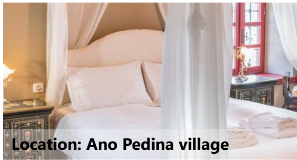
Location: Ano Pedina village