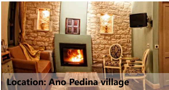
Location: Ano Pedina village