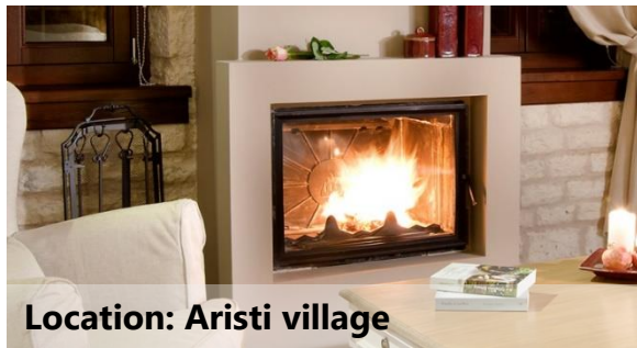
Location: Aristi village